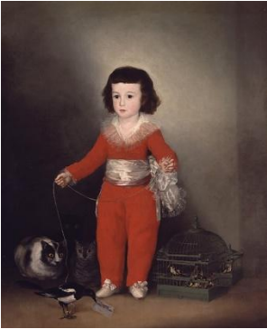
Don Manuel Osorio, by Francisco Goya

Art – We have just finished our first self-portrait! Students were to draw a full-body portrait of themselves with their favorite pet just like the portrait of “Don Manuel Osorio” by Francisco Goya.